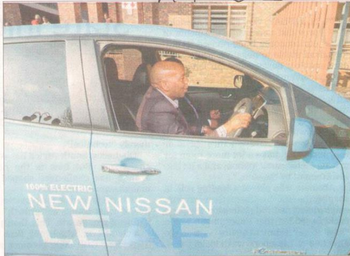
Tshwane mayor Kgosietso Ramokgopa will test drive a Nissan LEAF electric vehicle for the next two months.